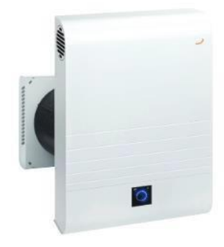
6. Wall Mounted Unit