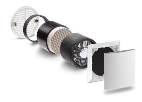
7. Through-the-Wall Unit

Please note that the products pictured in this bulletin have not been endorsed by Mass Save® and are listed only as examples.