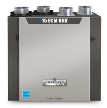
3. Heat Recovery Ventilator

Most HRVs and ERVs are installed with a duct system to exhaust air from specific rooms in the house and deliver fresh air to others. This duct system could either be its own independent system or can be integrated into the heating and cooling ductwork for homes with ducted heating and cooling. Overall, there are three main methods of ducting HRVs and ERVs: