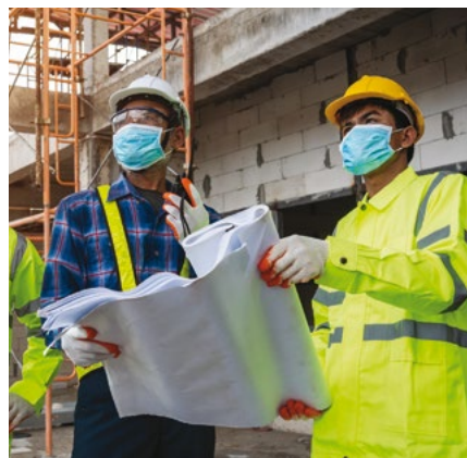
HEALTH AND SAFETY MEASURES

To date, more than 4,900 virtual pre-assessments have been completed, around 1,000 contractors have earned new skills from the online trainings, and more than 4,400 contractors have been trained on the health and safety guidelines.