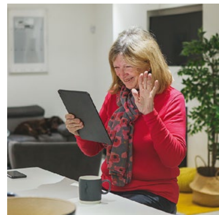
VIRTUAL PRE-ASSESSMENTS and enhanced incentives for customers